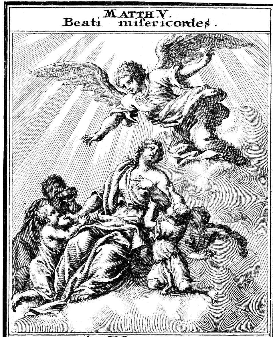
Woodcut illustration from a 1695 Bible – Matthew 5 (or Luke 6): Don't Judge. A woman is surrounded by children as an angel attends to her as a rendering of the fifth beatitude: "Blessed are the merciful for they will be shown mercy".